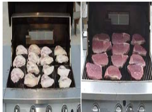
Cooking Performance Testing